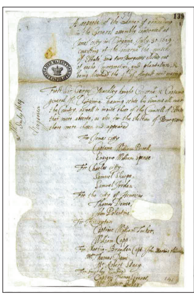
Original hand-written proceedings of the First Legislative Representative Assembly in America, July 30th, 1619 – Jamestown, Virginia – "Birthplace of America."

To the glory of God and in grateful memory of those early settlers, the founders of this nation, who died at Jamestown during the first perilous years of the colony. Their bodies lie along the ridge beyond this cross, in the earliest known burial ground of the English in America. These are they which came out of the Great Tribulation. Revelation VII: XIV.