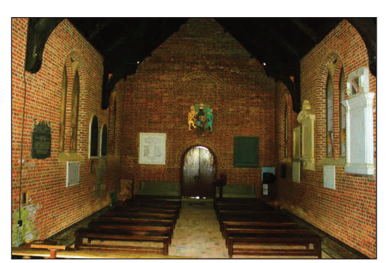
Interior of Jamestown Memorial Church, facing main, inner entranceway, prior to removal of British Coat of Arms and Motto – and erection of new, crude wooden permanent scaffolding, to left and right side walls, hiding memorial plaques by "Jamestown Rediscovery."

any pretence whatever, except for some meritorious services, to be adjudged and allowed by the Governor and Council." Acts of Assembly, 1769.