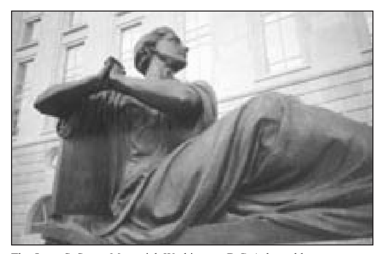
The Oscar S. Straus Memorial, Washington, D.C. A damsel leans upon a tablet of the Ten Commandments depicted in Roman numerals, as above the Bench, U.S. Supreme Court. Her hands are clasped in prayer. Sculptor: Adolph A. Weinman.